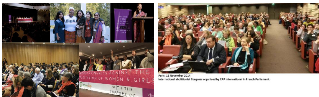
Paris, 12 November 2014 International abolitionist Congress organised by CAP International in French Parliament.